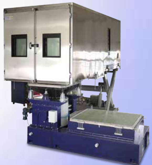
Chamber with vertical windows