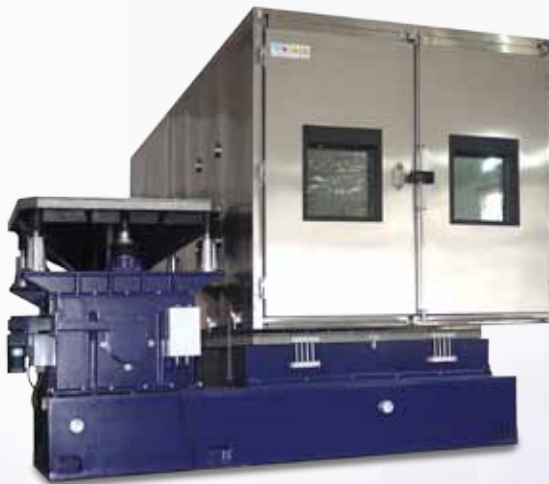
Chamber with horizontal windows